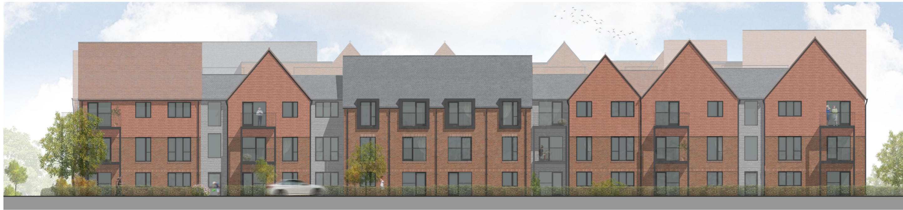
South-west elevation A-A, Dawley Road 1:200 @ A2