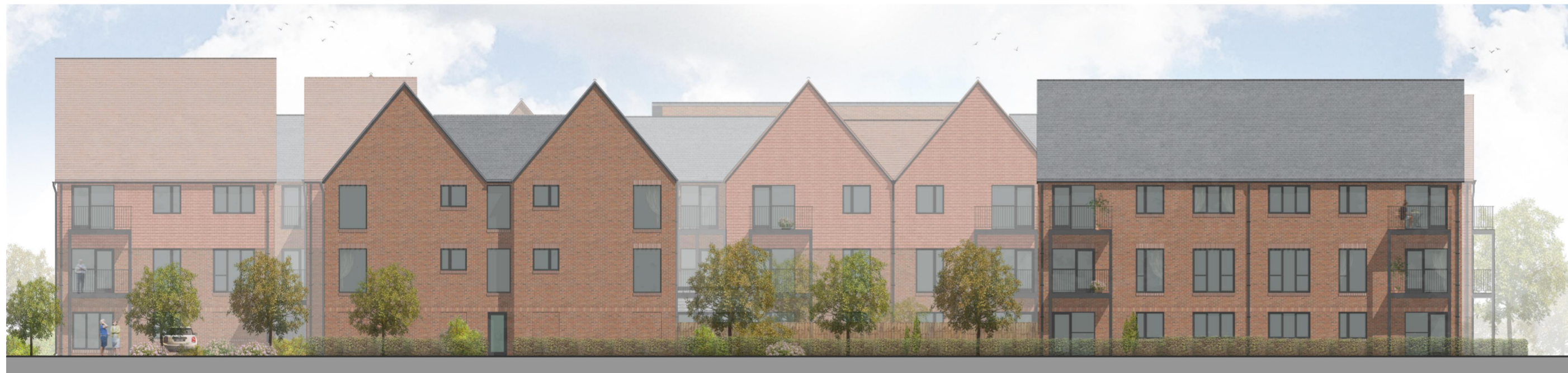
North-east elevation C-C 1:200 @ A2