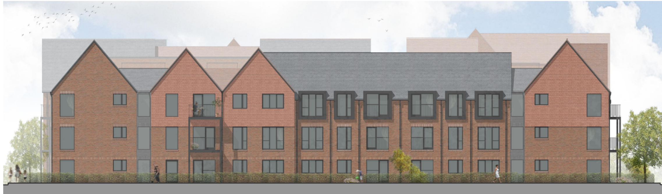
North-west elevation B-B, P.O.S. 1:200 @ A2