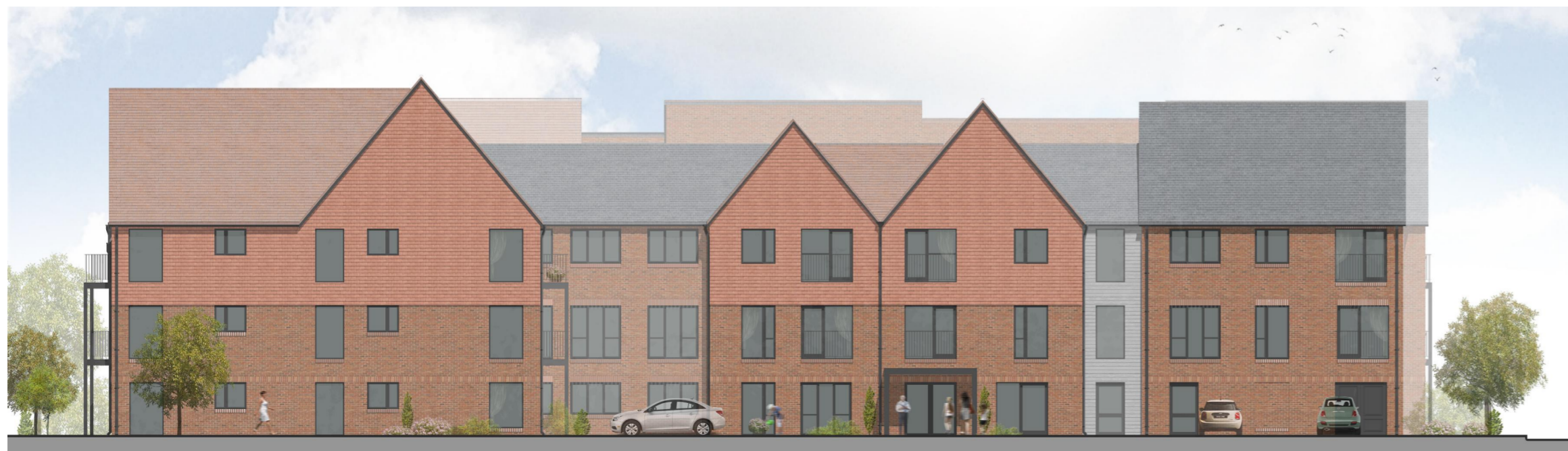
South-east elevation D-D 1:200 @ A2